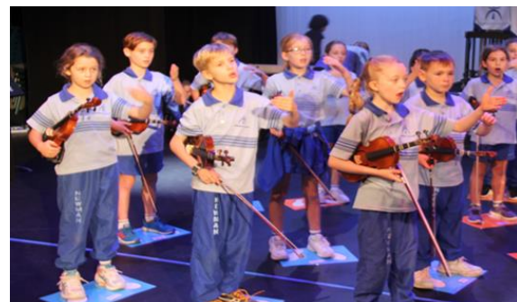
Year 3 String Ensemble

Year 3 students in the String Program participate in this beginner ensemble to give them a fun, group music-making experience, learning fundamental skills in string ensemble performance.