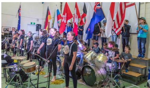
Beating Hearts Drum Band

Students who learn guitar, bass, drums or voice may be invited to join the Beating Hearts Drum Band to perform rock, pop and other contemporary repertoire. Often featuring smoke machines, visual displays, lighting effects and dance routines, this band is always a highlight at assemblies and Lavalla Campus concerts.